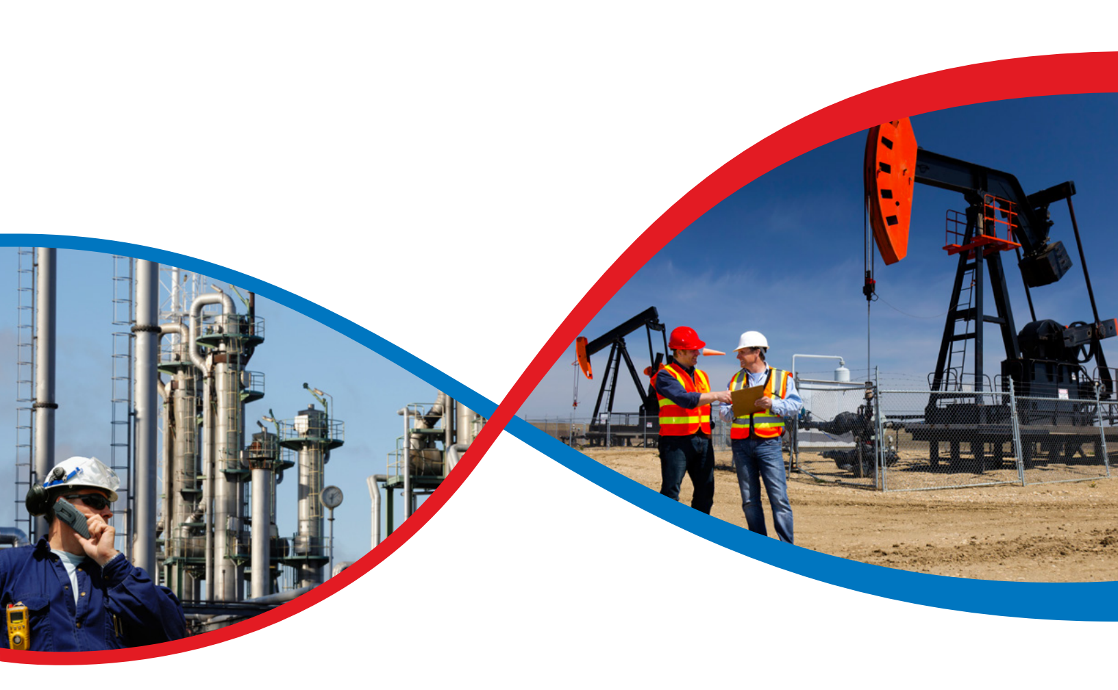
Products for Oil & Gas, Petrochemical and Chemical Industries